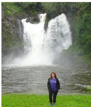
Me in Big Island April 2018

Queen Lili'uokalani, the first queen and last monarch of the Kingdom of Hawaii